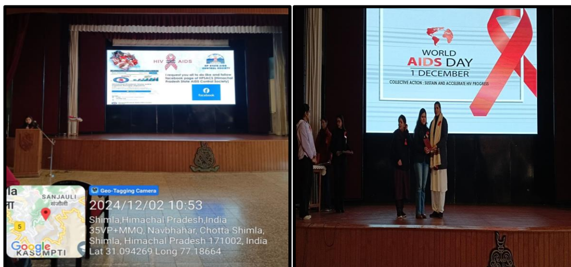
Power point presentation on World AIDS Day for HIV & AIDS Awareness