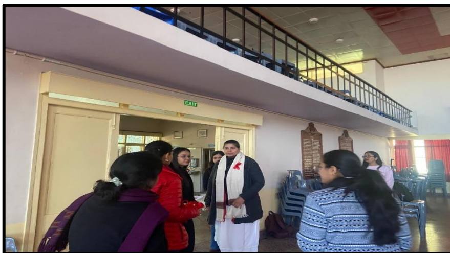
Pinning of Red Ribbon to Principal of college on the occasion of World AIDS DAY

On the occasion of World AIDS Day which was celebrated on December 2, 2024, a power point session on HIV & AIDS awareness was conducted in the college auditorium. The event started with pinning the red ribbons to the principal of the college, faculty and club members. The students were made aware about HIV & AIDS transmission and prevention through a power point presentation. After the power point session, a demo of AIDS toll free no 1097 was conducted to make students aware about AIDS helpline number and also how to use it.