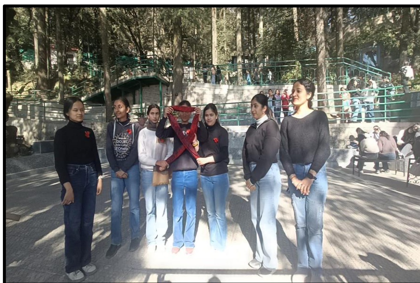
Red Ribbon Symbol formation

The symbol of Red Ribbon was also formed after the flash mob was conducted.