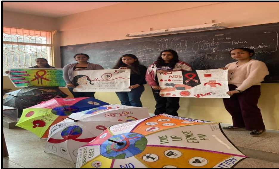
Poster and Umbrella Painting on HIV/AIDS awareness

Outcome: This event helped in spreading awareness about the importance of HIV& AIDS testing among Youth and also talked about fighting stigma and discrimination associated with HIV/AIDS.