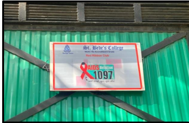
Billboard of RRC at Main Gate of College

The Billboard depicting the Toll free AIDS Helpline number was installed at the main gate of the college and also canteen.