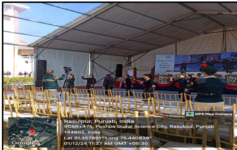
Flash mob on HIV/AIDS at State Level World AIDS Day function at Peterhoff

Flash mob was conducted on HIV/AIDS awareness at State Level World AIDS Day function held at Peterhoff, Shimla on December 1, 2024. The students of the Red Ribbon Club performed a flash mob on HIV& AIDS awareness at State level function graced by the Honourable Chief Minister, Shri Sukhvinder Singh Sukhu Ji.