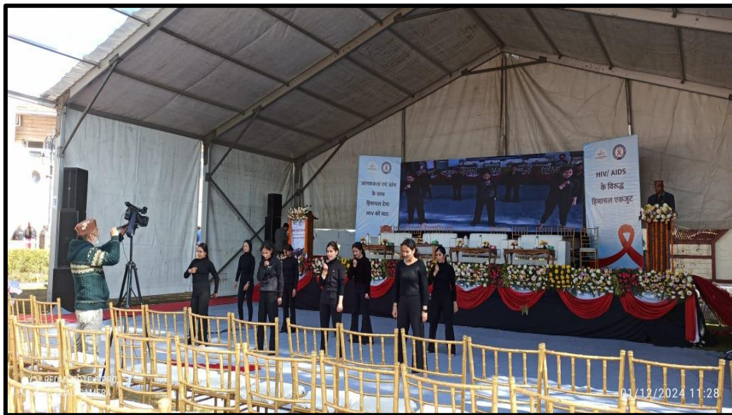
Flash Mob by RRC members on World AIDS Day