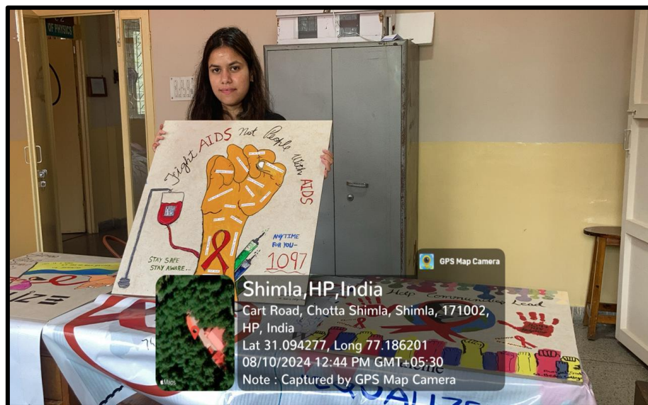
Tile Painting on HIV/AIDS awareness