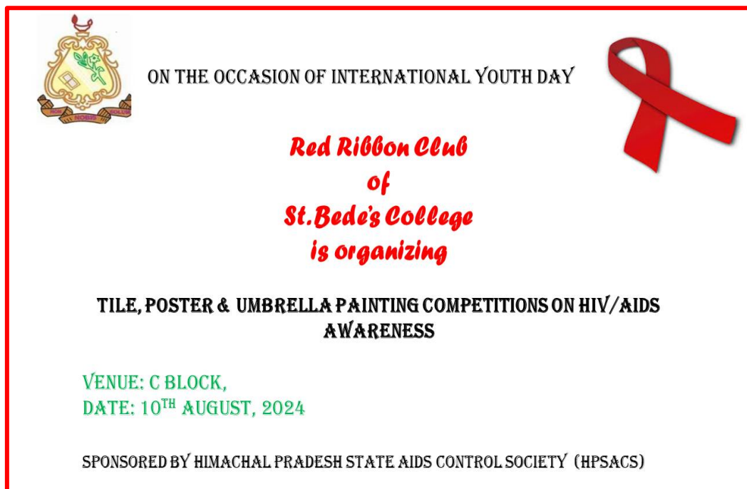
Brochure of Youth Day Competitions

Outcome: This event helped in spreading awareness about the importance of HIV& AIDS testing among Youth and also talked about fighting stigma and discrimination associated with HIV/AIDS.