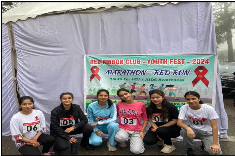
Student participants in Red Ribbon Club-Youth Fest marathon

On 11 th August, 2024, six students of RRC participated in Red Ribbon Club-Youth Fest marathon held at Chaura Maidan, Shimla.