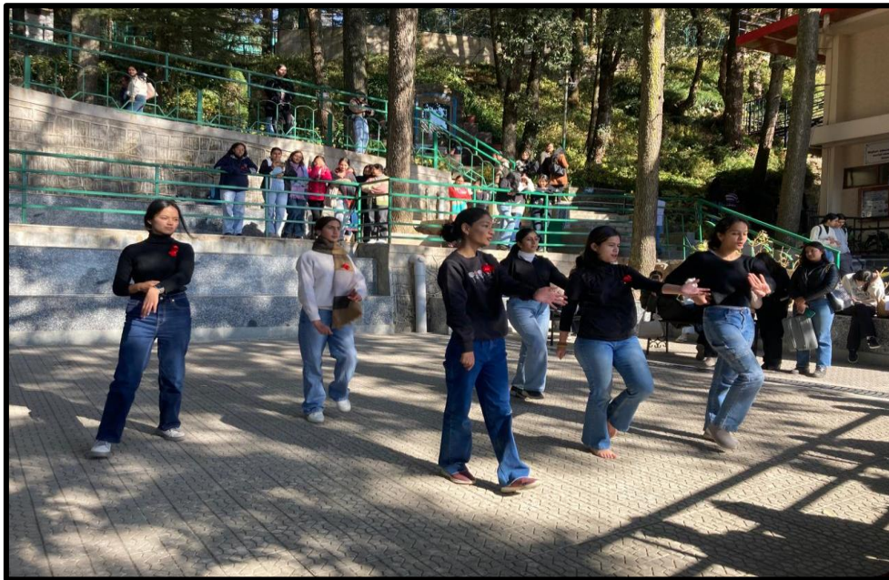
Flash mob on HIV/AIDS at College Courtyard on World AIDS Day

Flash mob on HIV/AIDS awareness was also conducted by the RRC members in the college courtyard on December 2, 2024.