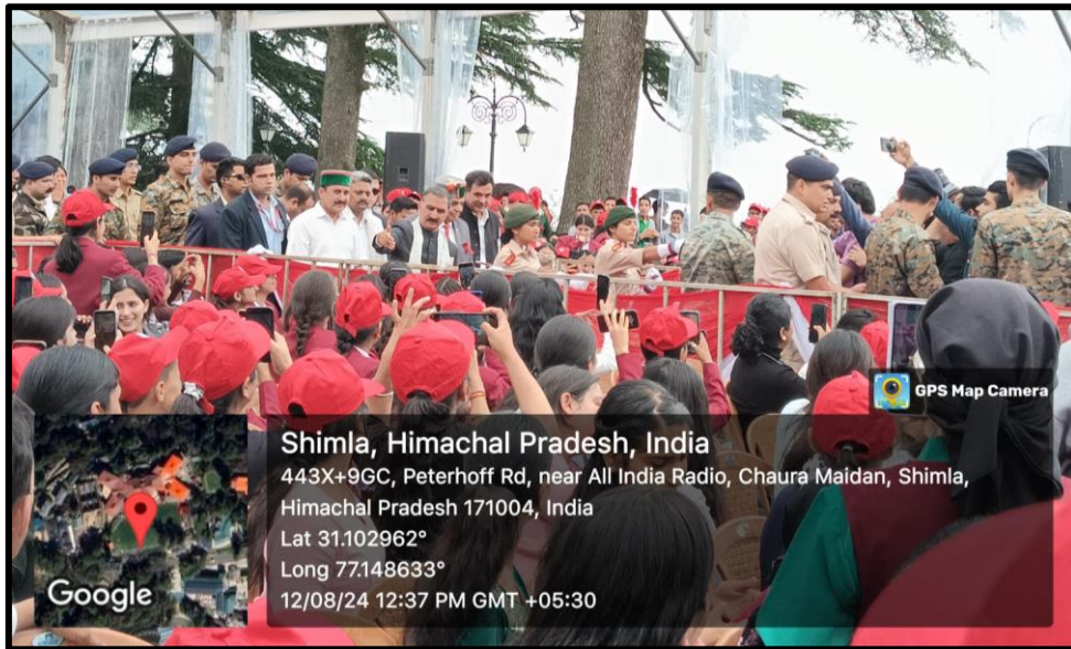
NCC students of St. Bede's College escorting the Hon. Chief Minister of Himachal Pradesh

All the selected paintings and posters were presented in the State level function on 12 th August, 2024 at Peterhoff, Shimla.