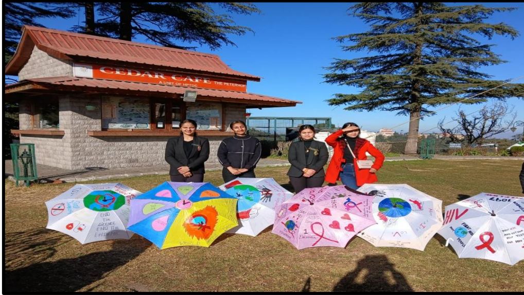
Umbrellas painted on HIV & AIDS awareness by RRC members for display at Peterhoff on 1 st December, 2024, World AIDS Day