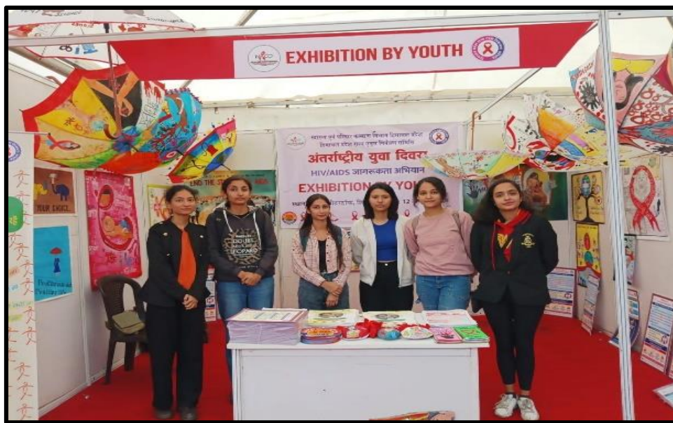
RRC student members at Exhibition Stall on HIV/AIDS awareness at Peterhoff

State Level Youth Day function was held at Peterhoff, Shimla on August 12, 2024. The Chief Minister Shri Sukhvinder Singh Sukhu was the chief guest. The student volunteers of the red ribbon club of the college participated in the function. Also exhibition of the paintings (umbrella, tile and posters) on HIV&AIDS awareness was showcased by the students.